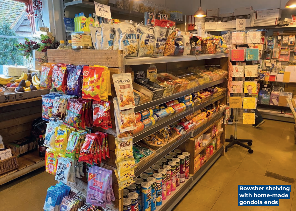
Bowsher shelving with home-made gondola ends

cooking in a home kitchen that's 30 or 40 years old, so we're going to have to do something about it. There's a lot of potential to offer something different.