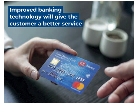
Improved banking technology will give the customer a better service

"Easy ID offers an easier and faster way in which customers can digitally prove their identity"