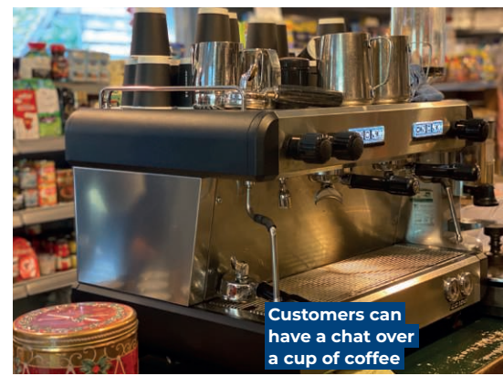
Customers can have a chat over a cup of coffee

Julia says: "It's like the Forth Bridge, it's not finished yet; it's been a rollercoaster really, but in the last two months, it's started coming together really – the feedback from customers is