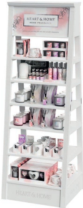
HEART & HOME

The market-leading Home Fragrance range featuring luxurious soy wax scented candles, reed diffusers and fragrance sprays including our best selling eco-friendly Bamboo collection.